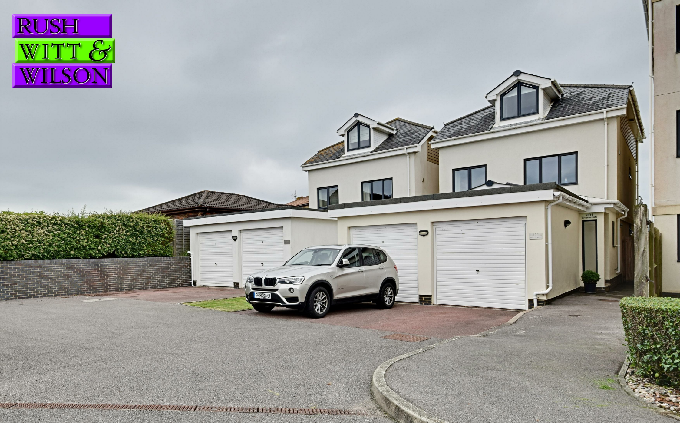
201 Cooden Drive, Bexhill-On-Sea, East Sussex TN39 3AE £1,150,000